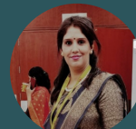
Dr Surbhi Kapoor Hegde hospital