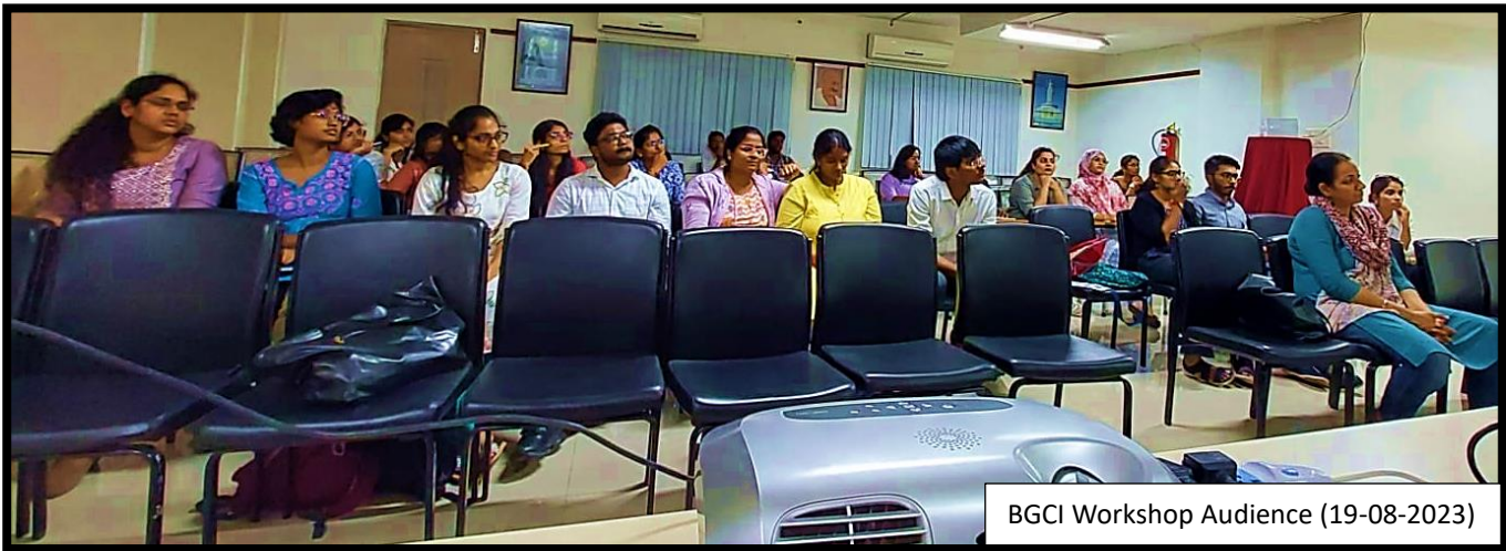
BGCI Workshop Audience (19-08-2023)