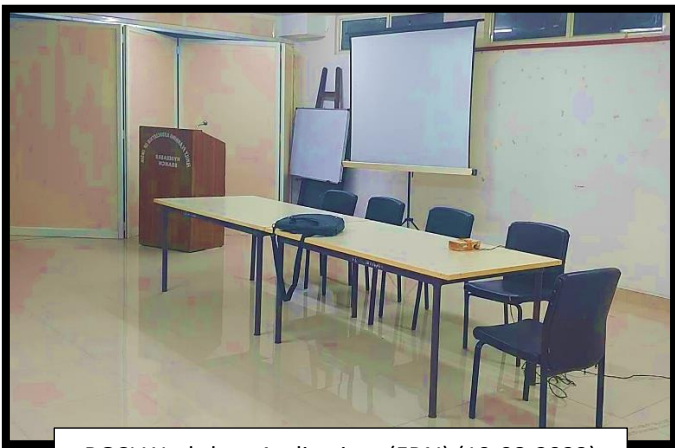
BGCI Workshop Auditorium (FPAI) (19-08-2023)