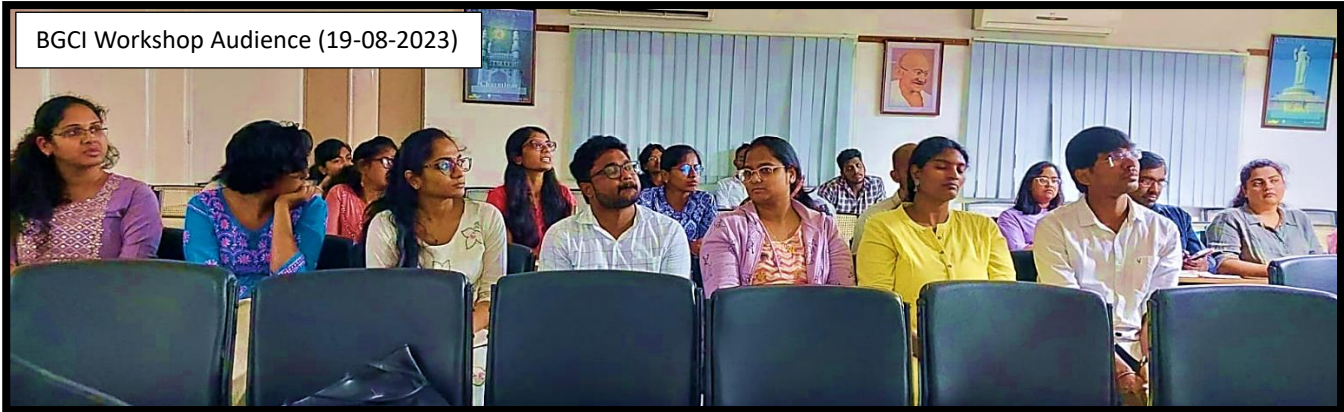
BGCI Workshop Audience (19-08-2023)